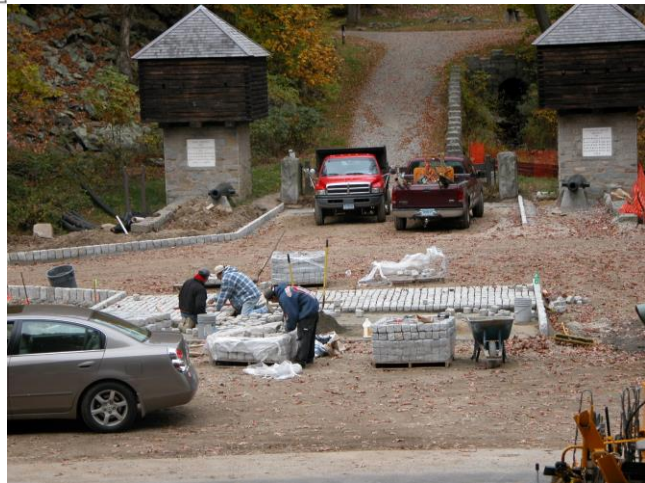
New park entrance coming soon