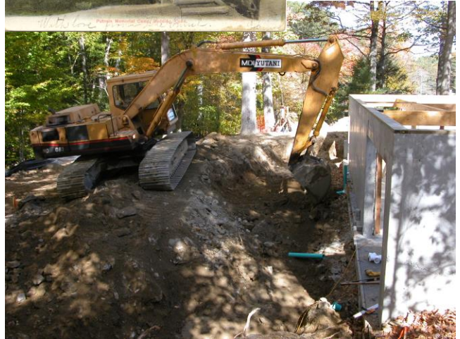
Oct. 2004. Digging out bottom walk-out level of the cellar.