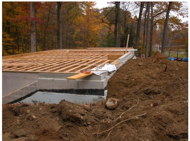
October 2004. The joists are complete, and the grading around the foundation is being completed.