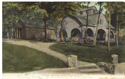
Guard House & Pavilion in 1907

The finished building will mirror the original pavilion shown in the photo in the upper right. It will have a skylight with windows as well as windows in the front and rear gables.