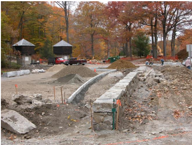
New parking lot coming soon