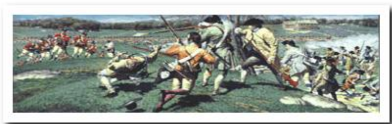
'Battle Road' - Militia battling against the British on their retreat back to Boston