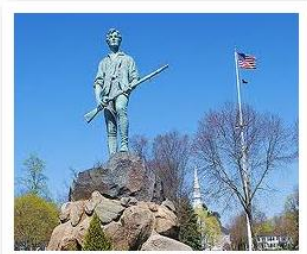
Minuteman statue on today's Battle Green